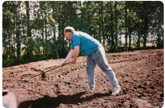
Work also holiday